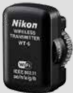
WT-6 (wireless transmitter)